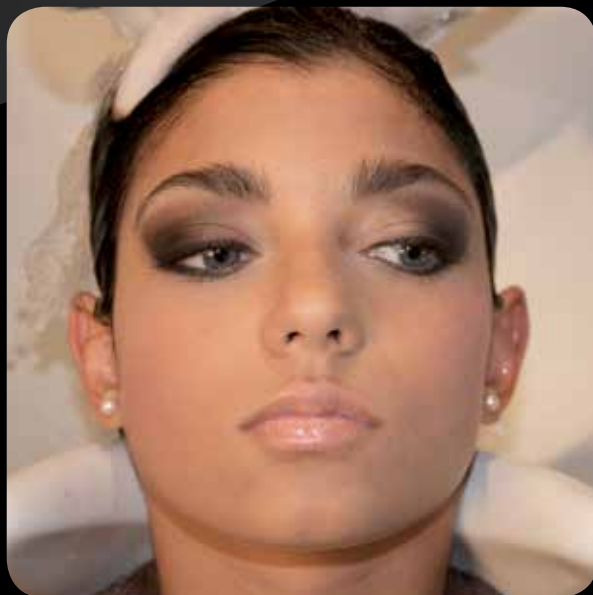
Final result after rinsing